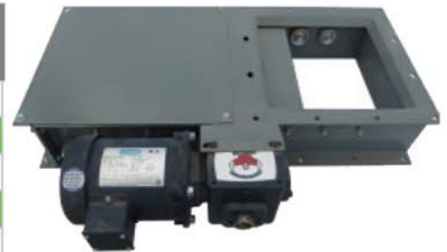
MOTOR/GEARBOX DRIVEN SLIDE GATES OPERATE AT 3.38" PER SECOND

ADD PRICE OF MANUAL SLIDE GATE TO COST OF SELECTED MOTOR/GEARBOX COMBO