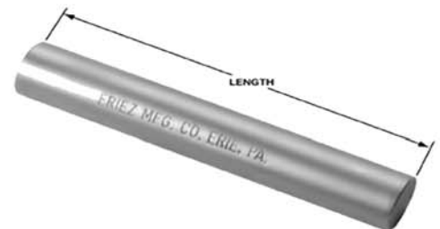
Ø1" WITH 1/4 x 20 TAPPED ENDS