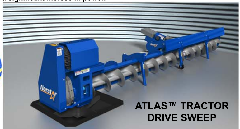
ATLAS™ TRACTOR DRIVE SWEEP