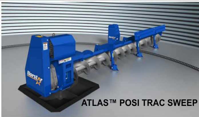
ATLAS™ POSI TRAC SWEEP