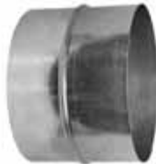
GALVANIZED PIPE COUPLINGS