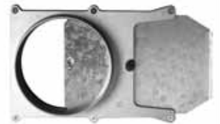
BLAST GATES (FULL SHOWN)