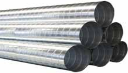
GALVANIZED SPIRAL SEAM PIPE