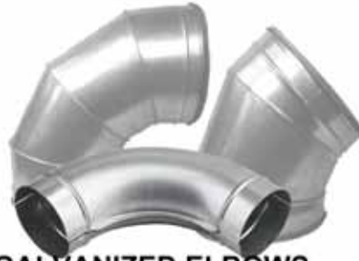
GALVANIZED ELBOWS (r = 1½D)