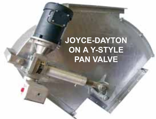
JOYCE-DAYTON ON A Y-STYLE PAN VALVE

Joyce-Dayton drives are available in 1ph or 3ph (motor is C-faced to actuator) and come as either TEFC weathertight or Nema 9 explosion proof. They operate at 1.43 inches per second. They require separate wiring for motor (power) and the limit switches, though the TEFC models have built in limit switches. Potentiometers are unavailable for Joyce-Dayton drives. The 1/3 hp Motor drive produces 375 lbs of force, the 1/2 hp Motor drive produces 550 lbs of force, and the 3/4 hp Motor drive produces 850 lbs force. Joyce-Dayton drives are American made in Dayton, OH.