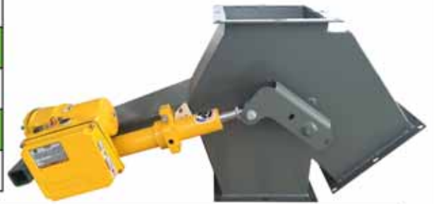
ANDCO ACTUATOR MOUNTED ON A K-STYLE PAN VALVE

Andco Actuators are available in 1ph or 3ph and come hazardous duty standard. They are pre-wired from the factory with the limit switches and motor (power) wired together. They are available with a built-in potentiometer. No tools necessary to adjust the limit switches. Andco Actuators produce 750 ft/lbs of working load and operates at .8 inches per second. They are American made in Houston, TX.