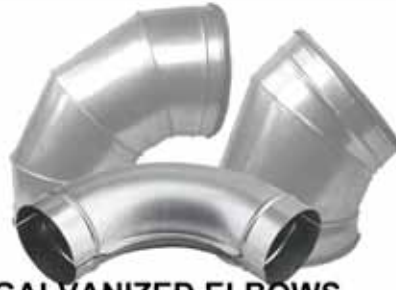
GALVANIZED ELBOWS (r = 1½D)