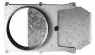
BLAST GATES (FULL SHOWN)