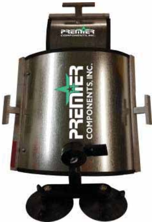
EXTENSION KIT A