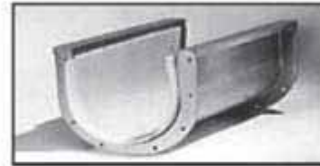
UHMW U-Trough Liners

Specify Plain, Semi-Flanged or Flanged. Hip-Roof Covers are also available.